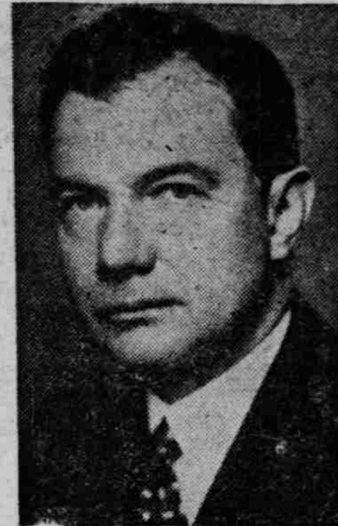
Robert H. Jackson, who will be the chief speaker at Tuesday's observance of University Day, will be introduced by President Frank Graham.