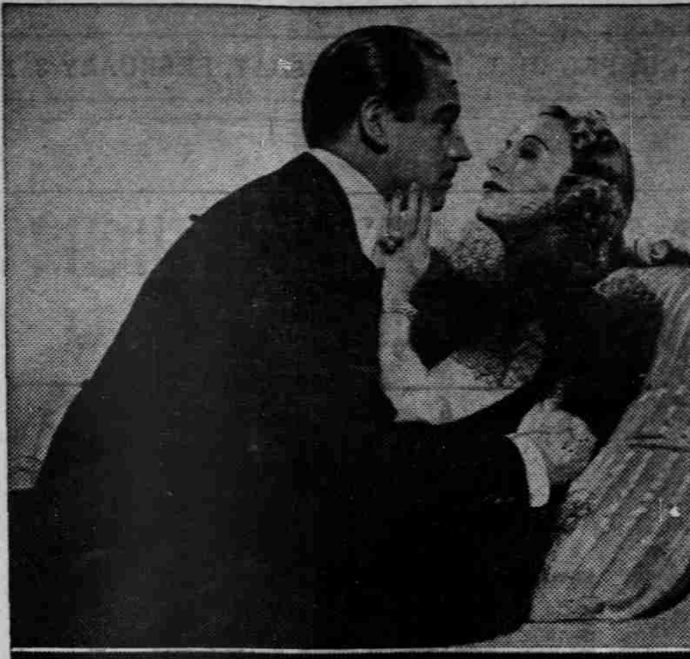
Melvyn Douglas and Grace Moore are seen above in one of the romantic interludes of their latest picture, Columbia's "I'll Take Romance," showing today at the Carolina Theatre. It is described as Miss Moore's most mirthful and melodious film to date.