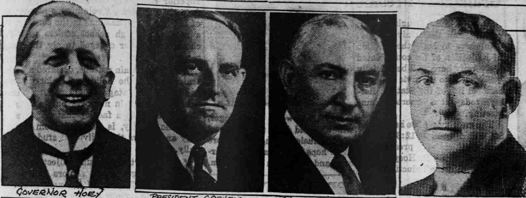
GOVERNOR HOEY PRESIDENT GRAHAM CHARLES T. WOOLEN J. C. B. EHRLINGHAUS