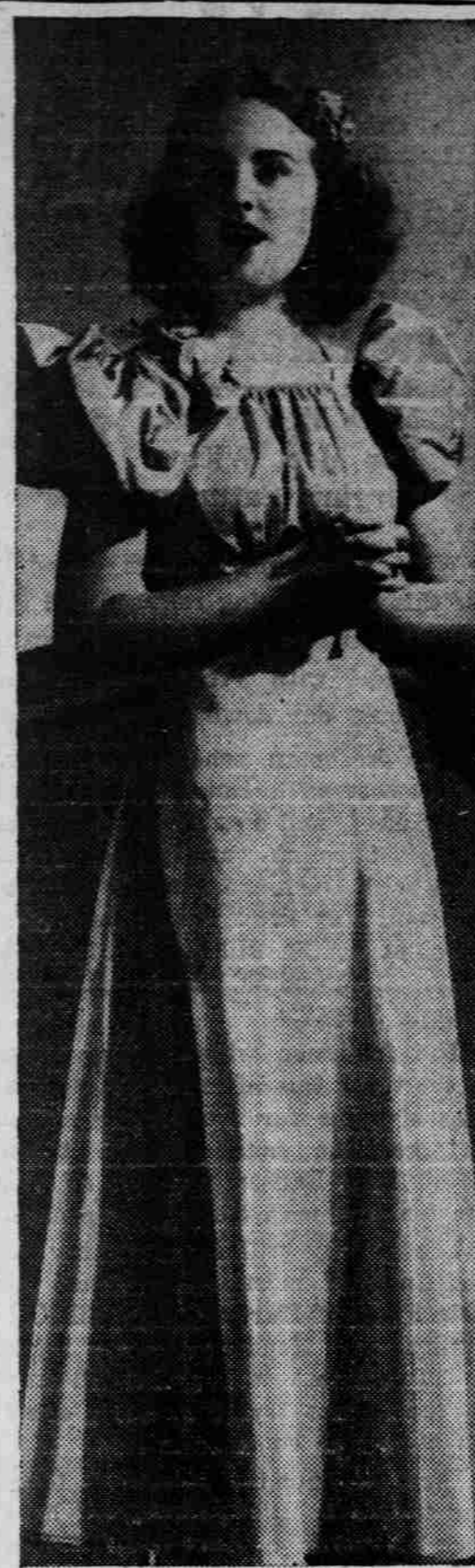
Deanna Durbin sings four songs in Universal's refreshing comedy drama "Mad About Music," playing today and tomorrow at the Carolina Theater.