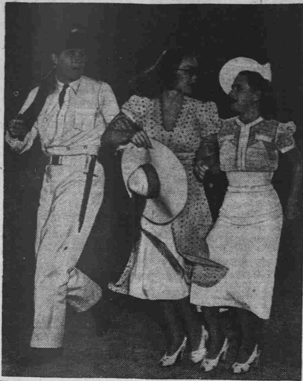
THIS ISN'T A PINCH—Wayne Morris and Priscilla Lane take Jane Wyman (center) along as an unwilling chaperone when they set out to break some VMI rules in "Brother Rat," the comedy about life at Virginia Military Institute, which is now showing at the Carolina theatre.