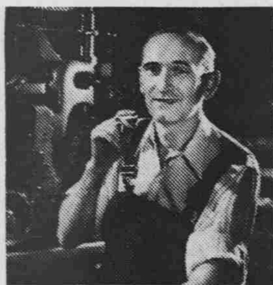
EDDIE CANTOR—America's great comic personality—each Monday evening on the Columbia Network. 7:30 pm E.S.T., 9:30 pm C.S.T., 8:30 pm M.S.T., 7:30 pm P.S.T.

They know how pleasant life can be when they "LET UP—LIGHT UP A CAMEL"