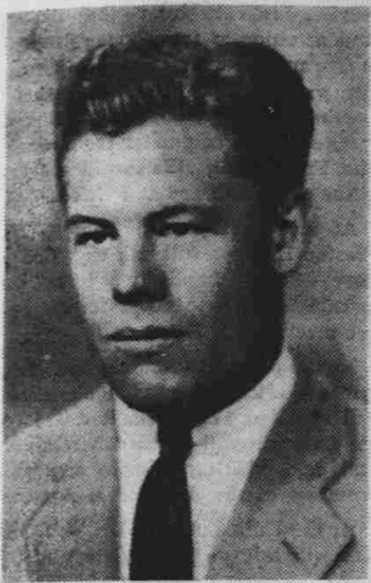
... campaign manager ...