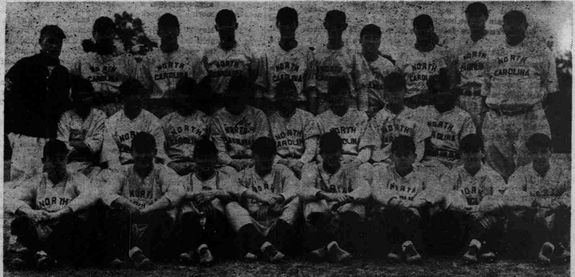
CHAMPIONS OF THE SOUTHERN CONFERENCE AND THE BIG FIVE , the University of North Carolina baseball team won 11 of 14 Southern conference games to take the conference championship for the first time since 1933.

The Tar Heels won seven of eight games in the State, losing only to Duke. Other teams to defeat Carolina were Navy, Maryland, William and Mary, Cornell, Michigan and Duke.