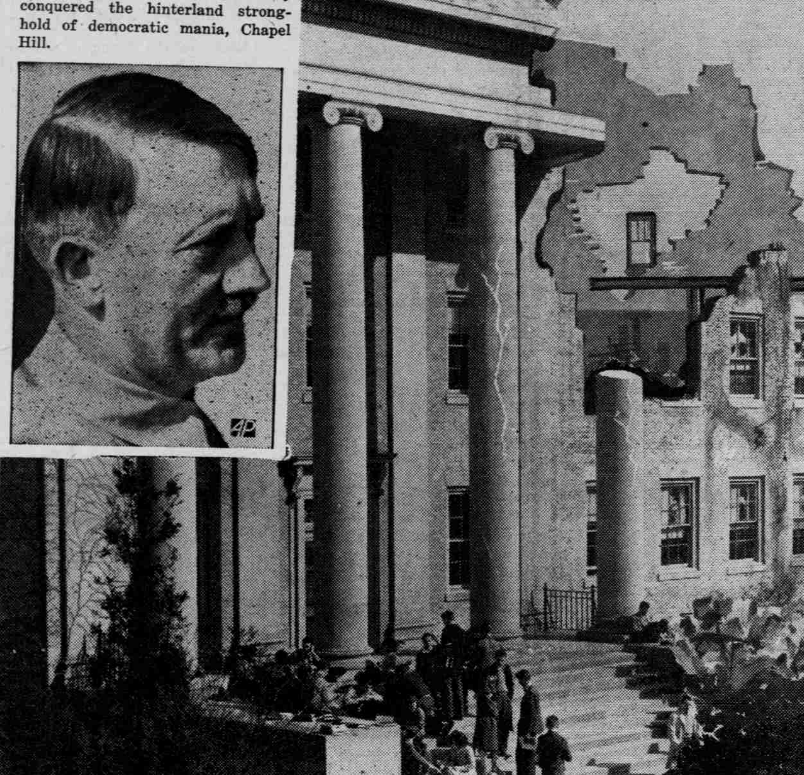
ADMINISTRATION CENTER of the former ruthless democratic regime, picturesquely named South Building, shown after being struck and destroyed by high-powered German demolition bombs. Squadron after squadron of the Luftwaffe raided Chapel Hill during the battle yesterday.