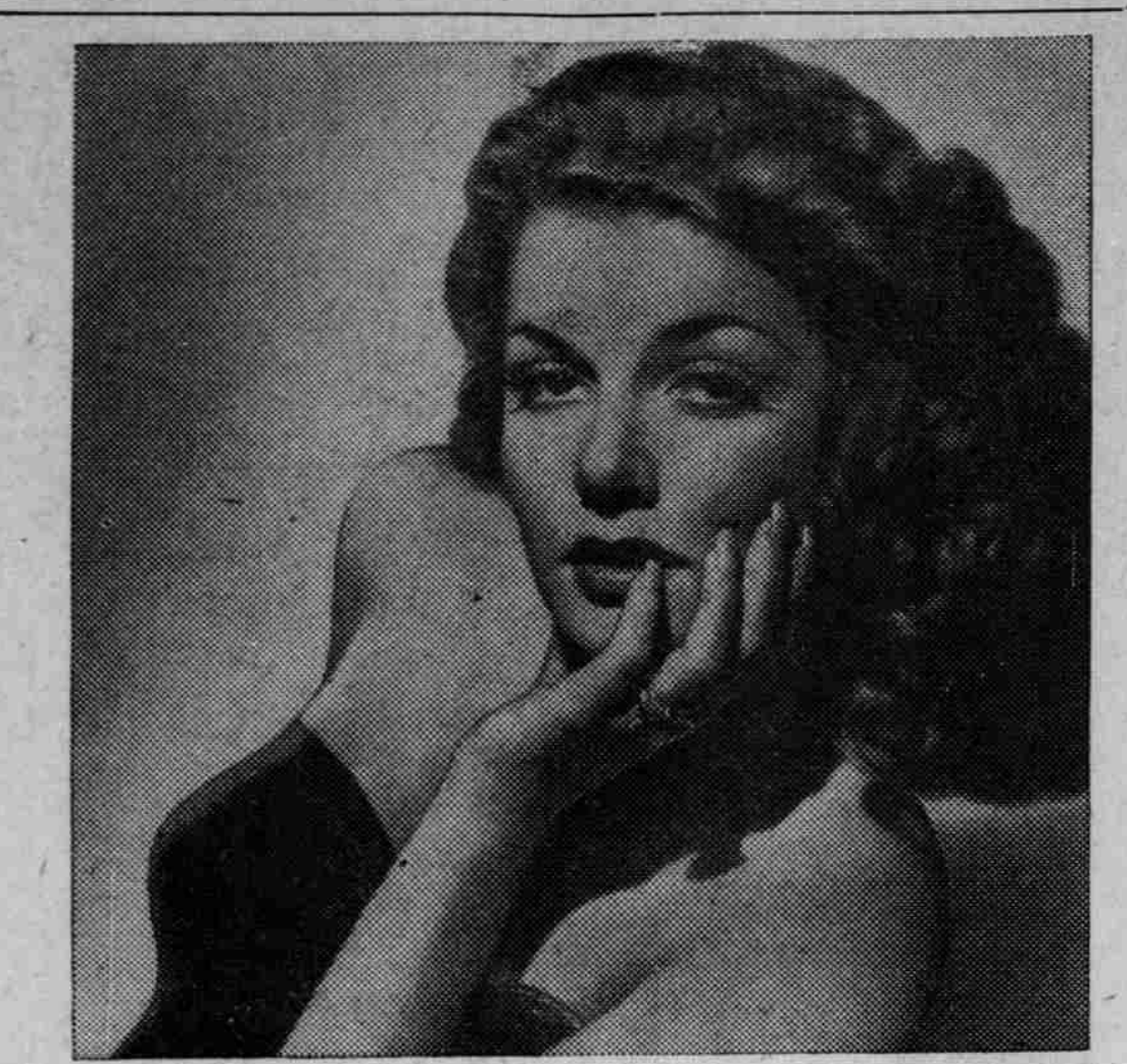
ENCHANTING ANN SHERIDAN plays the role of a nickel-a-dance girl in Warner Bros.' exciting film, "Juke Girl." The picture is now at the