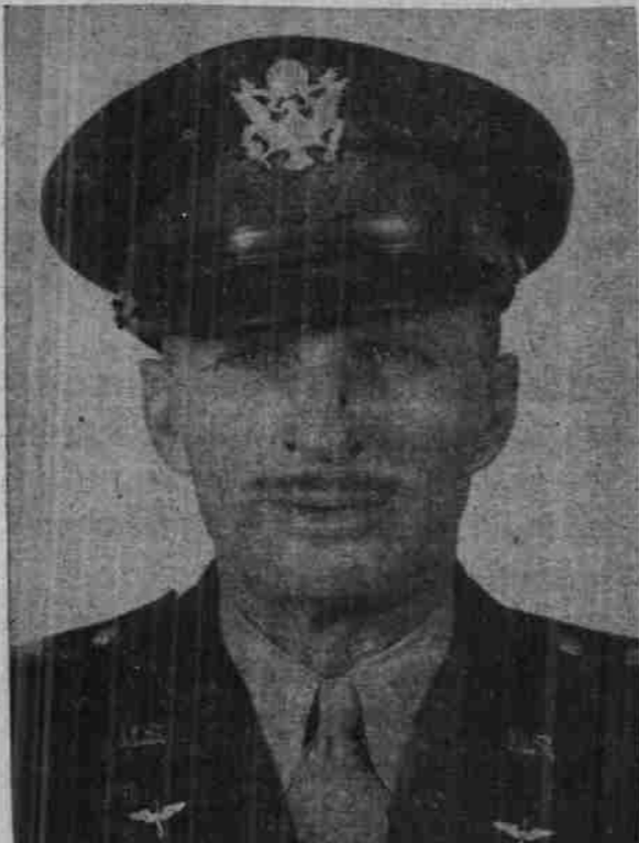
MAJOR LIGHT has been transferred to a new Army post but when contacted stated he had noticed no planning for the consolidation of the two schools.