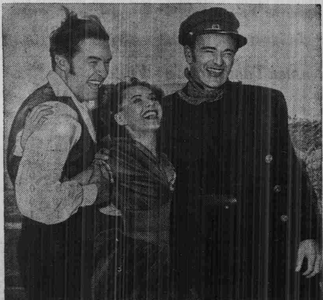
ENJOYING THE BREEZE are Stars Ray Milland, Paulette Goddard and John Wayne, who play the principal roles in the new Cecil B. DeMille Paramount adventure spectacle in Technicolor, "Reap the Wild Wind," which is arousing hurricane interest at the Carolina Theatre.

SHIRTS • TIES • HANKERCHIEFS • UNDERWEAR • SPORT SHIRTS * BUY WAR BONDS AND STAMPS *