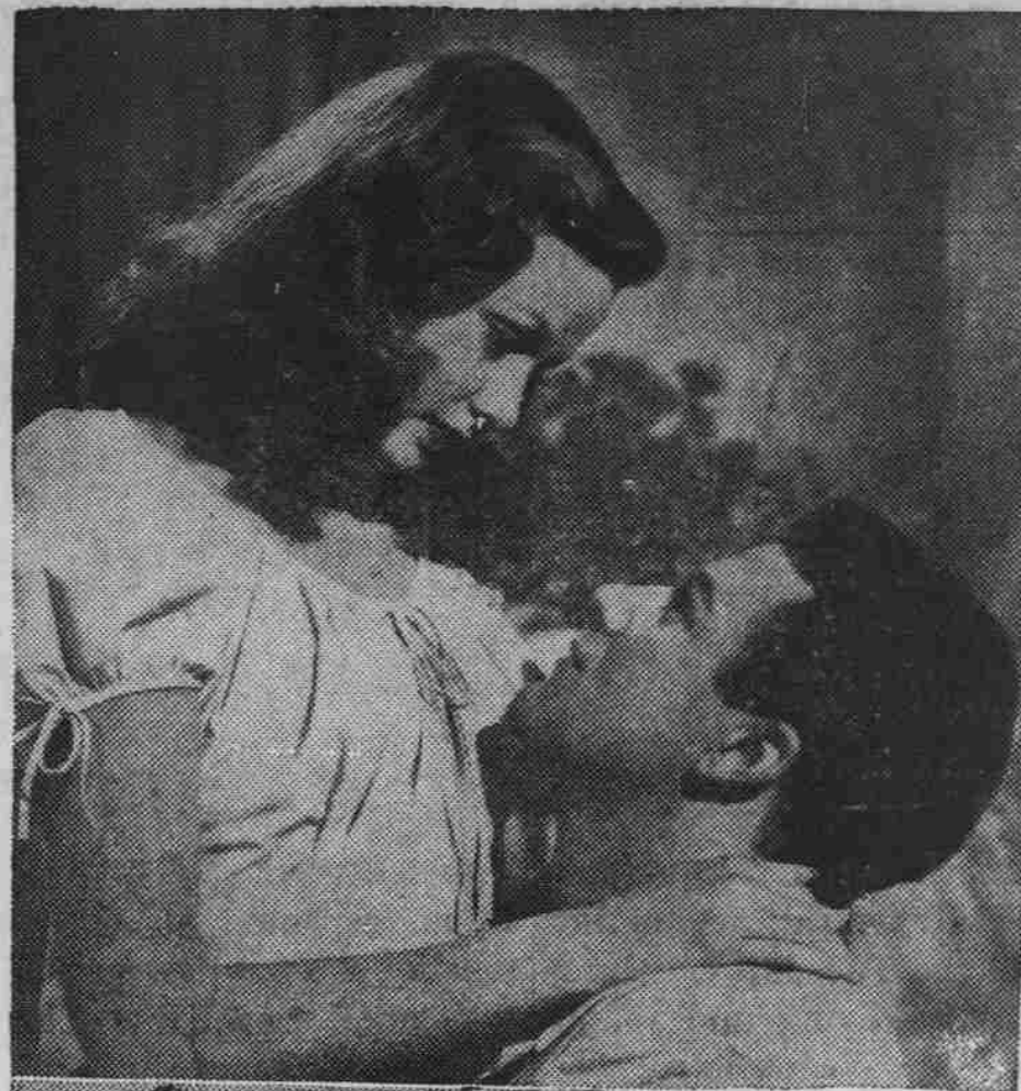
Gene Tierney and Cornel Wilde are starred in the psychological screen drama, "Leave Her to Heaven," 20th Century-Fox's technicolor filmization of the Ben Ames Williams best-seller. The picture plays today and tomorrow at the Carolina theatre and stays over for an extra showing at the Pick theatre Tuesday.