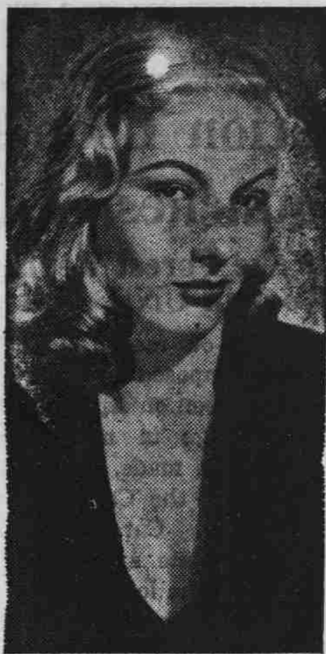
Above is Veronica Lake who stars with Sonny Tufts in "Miss Susie Slagles" now playing at the Carolina Theatre.

flight to Australia. The plane, a Douglas DC-4, is trying to set a new trans-Pacific speed record.