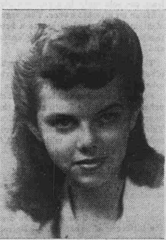
Flashing a double dimple is Joseentry for "Miss Candlelight."