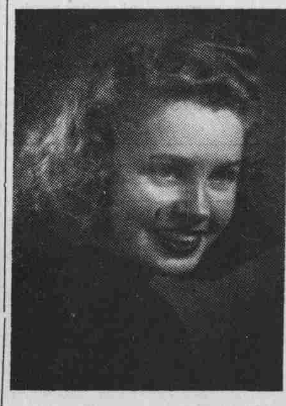
Pi Kappa Alpha choice for campus hails from Greensboro.