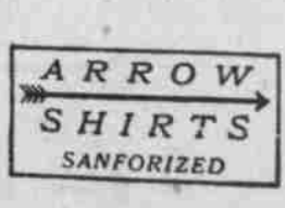
Arrow Shirts Sanforized