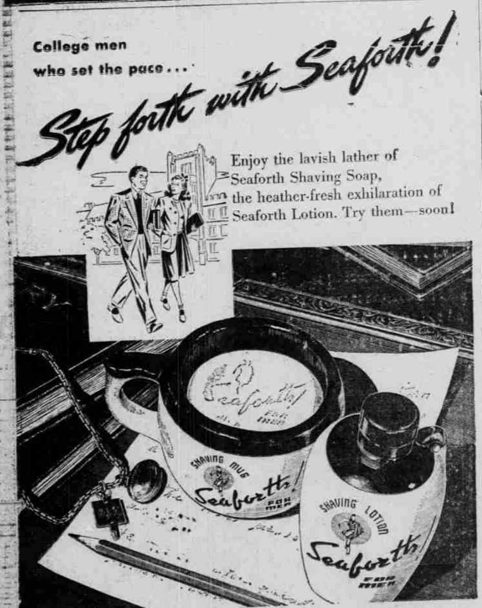
These and other Seaforth essentials... each packaged in handsome stoneware, only $1. Gift sets, $2 to $7. Seaforth, 10 Rockefeller Plaza, New York 20, N.Y.