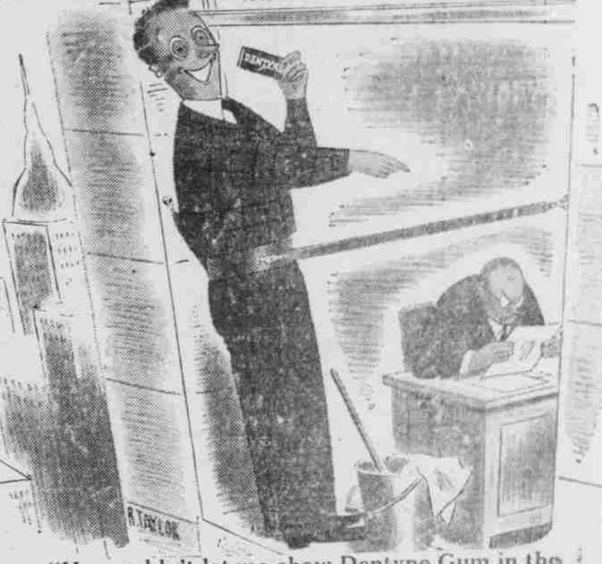
"He wouldn't let me chew Dentyne Gum in the office so I got an outside job."

WIN $25! Send us your idea for a Dentyne cartoon and caption! Draw it, if you prefer, but you don't have to be an artist. Just describe the cartoon situation and give us the caption. If your idea is accepted for publication, we'll send you $25. Mail it to Dentyne, Boz 283, accepted for publication, we'll send you $25. Mail it to Dentyne, Boz 283, Radio City Post Office, New York 19, N. Y. Go ahead—you can use that $25! Radio City Post Office, New York 19, N. Y. Go ahead—you can use that $25! . . . All entries become the property of American Chicle Company—we pay only for those we print.