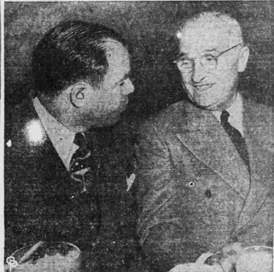
President Truman is shown talking with Senator J. Howard McGrath of Rhode Island, guest-of-honor at a luncheon given by Democratic Senators, during an unexpected visit to Capitol Hill. McGrath was recently named Chairman of the Democratic National Committee, succeeding Postmaster General Robert Hannegan.

After tonight the Vet's Club will be closed for the Thanksgiving holidays but will reopen immediately after the game Saturday to all members and their friends.