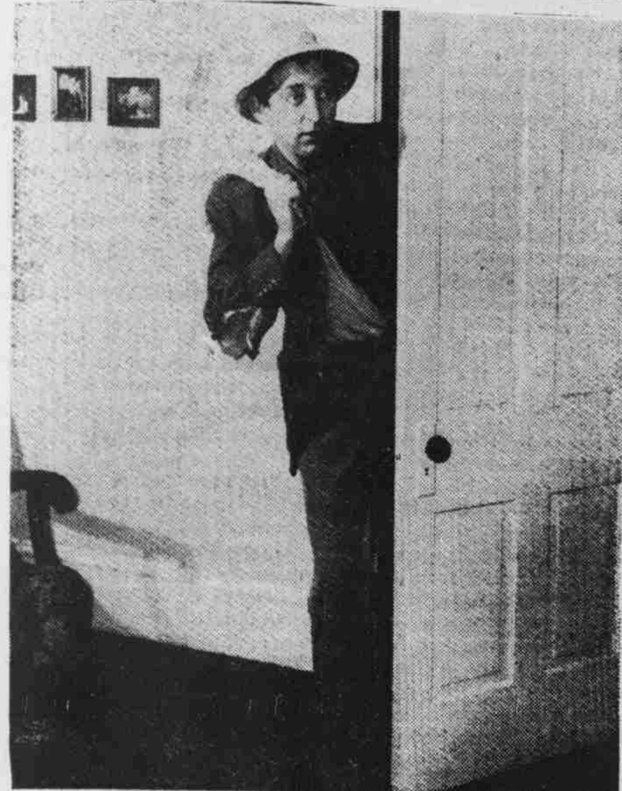
HERE IS THE THIEF, of "The Old Maid and the THIEF," one of two comic operas being given tonight under the auspices of the Student Entertainment committee. The presentations are free to members of the student body.