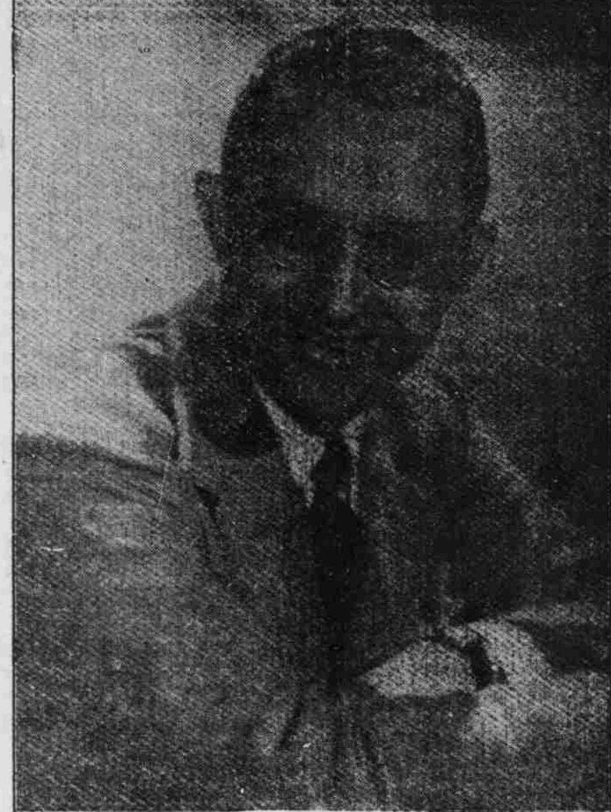
TOMMY DORSEY AND HIS ORCHESTRA will touch off the mid-winter German club weekend with a formal dance in Woolen gymnasium at 9 o'clock tonight. The dance tonight will be followed by a concert tomorrow afternoon in Memorial hall and another formal tomorrow night.

Students have their green form change slips prepared by their faculty advisors, then carry them to the Registration office to have them posted to the green forms.