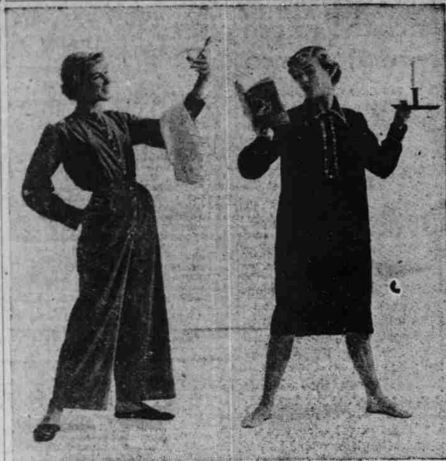
LET CAMPUS WINDS howl and frost lace your window—these flannelite dorm fashions will warm you like an Alma Mater sing. In policeman blue or fireman red—the pajamas for about $5, the nightshirt about $4—you'll want the whole team, and wear the nightie over pajamas during those "wee sma' hour gabfests." Good Housekeeping editors especially like the Tyrolean influence of their cotton braid trim.

After the first day of the formal rushing period, new men may visit fraternity houses at