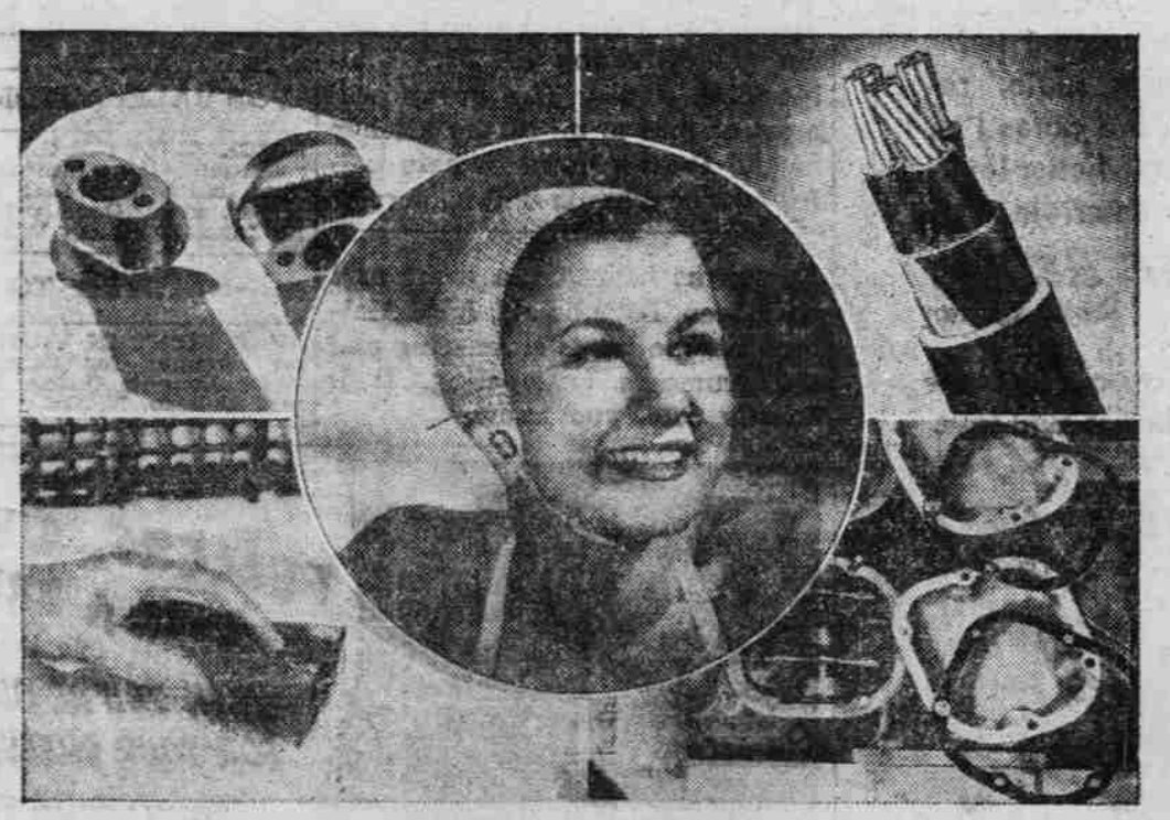
Motor mountings, wire and cable, sponge, gaskets, swim caps are among possible uses for Du Pont's new Neoprene Type W.

ber produced by Du Pont researchhas long outpointed natural rubber on many counts. Because of its greater resistance to chemicals, flame, heat, sunlight, weathering, oxidation, oils, grease and abrasion, it is widely used in such products as industrial hose, conveyor and transmission belts, insulated wire and cable, hospital sheeting, gloves and automotive parts.