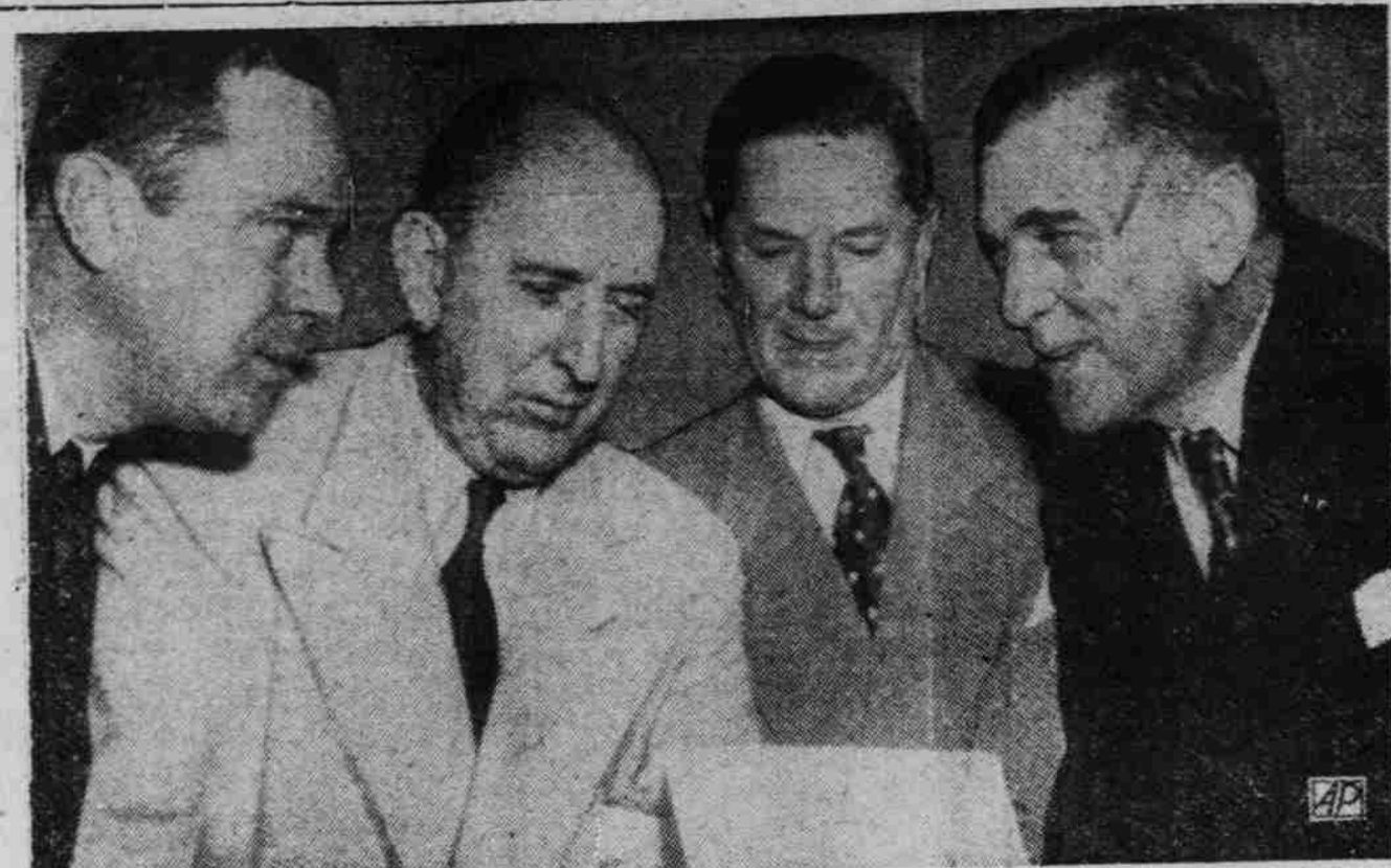
FOUR SOUTHERN SENATORS get together in a hallway at Washington and discuss their fight to prevent Fair Employment Practice legislation from coming before the senate. Left to right: Russell Long of Louisiana, Richard B. Russell of Georgia, Burnet R. Maybank of South Carolina, and John C. Stennis of Mississippi. Georgia's Russell is floor leader for the southern group.