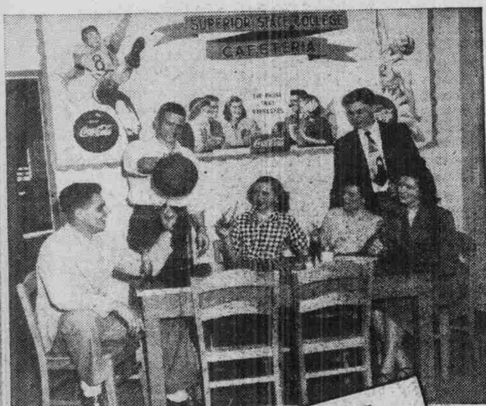
Cafeteria Superior State College Superior, Wisconsin

L.S./M.F.T.-Lucky Strike Means Fine Tobacco