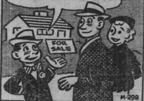
For full information contact your nearest VETERANS ADMINISTRATION office

MORE TEETH HAVE BEEN ADDED TO THE LAW THAT PROHIBITS CHARGES ABOVE V.A.'S "REASONABLE VALUE" FOR HOMES BOUGHT WITH GI LOANS...VETERANS NOW MAY SUE THE SELLER FOR THREE TIMES THE AMOUNT OF THE OVERCHARGE