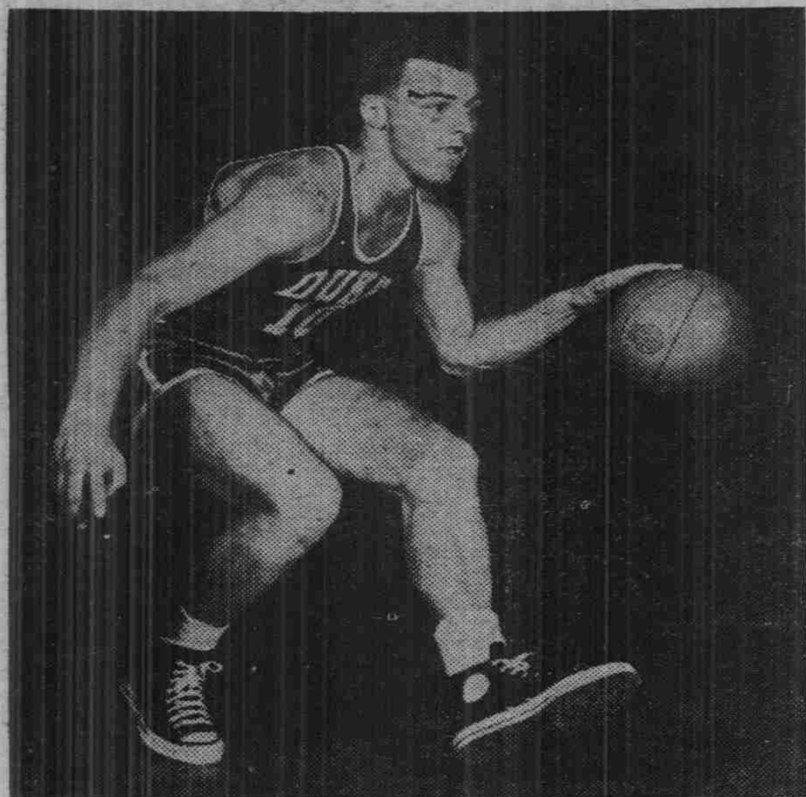
ALL-AMERICAN DICK GROAT will be the big attraction here tomorrow night when the Carolina basketball team plays Duke's Blue Devils. Groat is averaging better than 24 points per game, exceeding his average of last year when he set a record for the number of points scored in one year. He was "held" to 16 points by Carolina in the last game with Duke, but he's always given a great exhibition in Woollen Gym.

Following the Duke game, Carolina plays West Virginia Wednesday in Morgantown. Should the underdog Tar Heels lose both