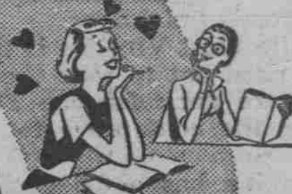
"He's got such a smooth line!" "For a smooth line, I'll take the new '21' any day."