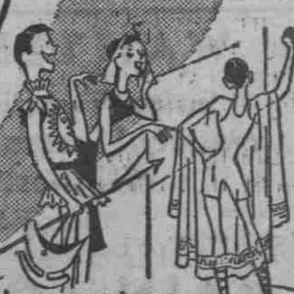
"He's as easy to see through as the 21's Pli-glass reservoir."