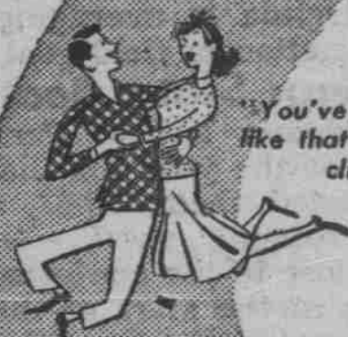
"You've got a grip like that new '21' clip!"