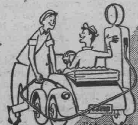
"Stops for filling are few and far between. It's like my new '21' Pen."

New Parker "51" and "21" Pens "write dry" with Superchrome Ink. No blotters needed! (They also use any other fountain pen ink.)