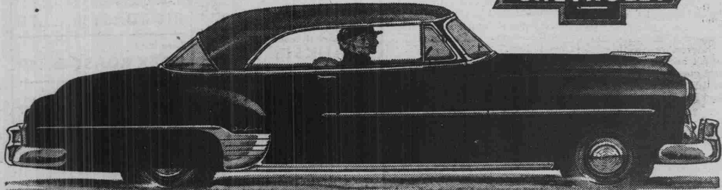
LOWEST PRICED IN ITS FIELD This big, beautiful Chevrolet Bel Air—like so many other Chevrolet body types—lists for less than any comparable model in its field!