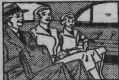
Alluring New Interior Colors