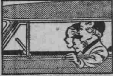
Extra-Safe Jumbo-Drum Brakes

Check them over, one by one, all the things you want in your next car. Then come in, examine and drive this big, bright, beautiful Chevrolet for '52! We believe you'll agree you've found your car; and we know that you'll discover that Chevrolet offers the most fine car features at the lowest cost. For here are the only fine cars priced so low. Brilliantly new in styling . . . outstandingly fine in quality . . . and lowest-priced line in their field! Come in—now!