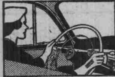
Extra-Easy Center-Point Steering