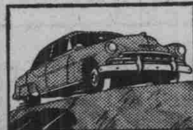
39-Year Proved Valve-In-Head Engine Design