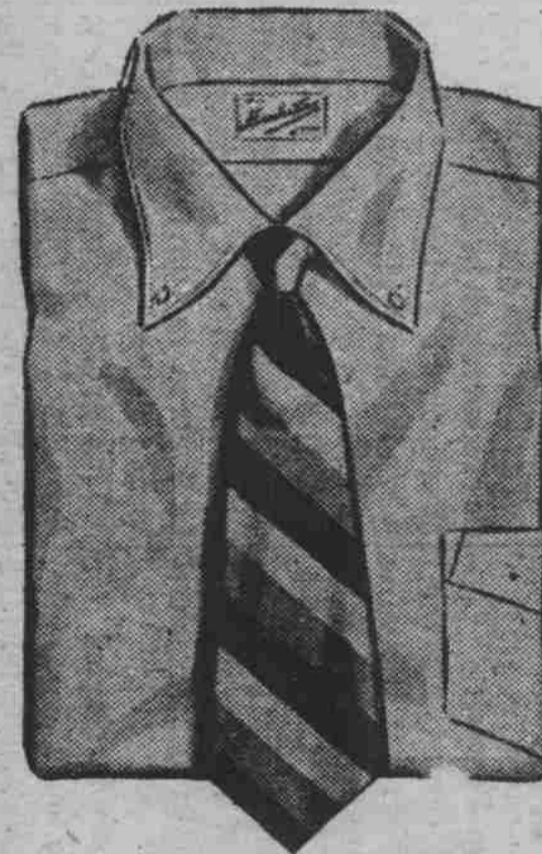
The Manhattan Burt!

Nothing gets admiring glances on the campus faster than a handsome guy in a handsome shirt. To look your handsomest, try on a Manhattan Burt or a Manhattan Range.