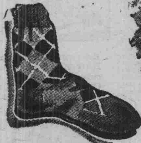
Hosery by Holeproof in rich Argyle patterns.