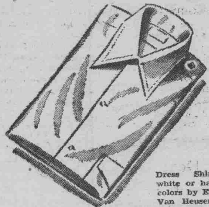
Dress Shirts in white or handsome colors by Enro and Van Heusen.