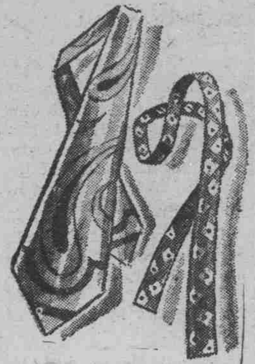
Weekwear for every occasion, for every shirt by Damon Creations and Superba Cravats.