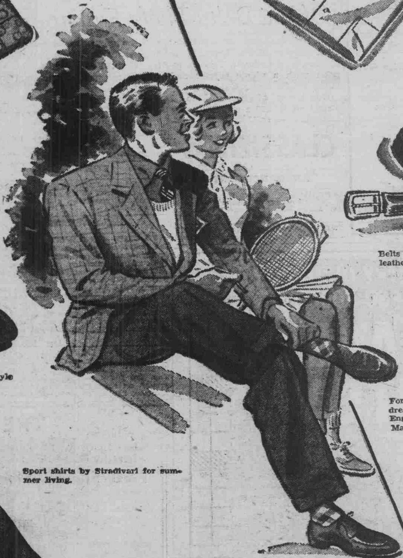
Sport shirts by Stradivari for summer living.