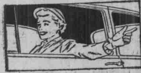
EXTRA STOPPING POWER of Jumbo-Drum Brakes