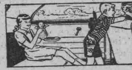
EXTRA STRENGTH AND COMFORT of Fisher Unisteel Construction