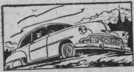
EXTRA SMOOTH PERFORMANCE of Centerpoise Power