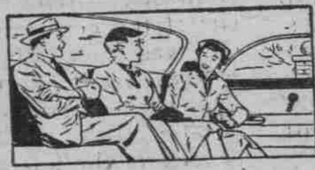
EXTRA RIDING COMFORT of Improved Knee-Action