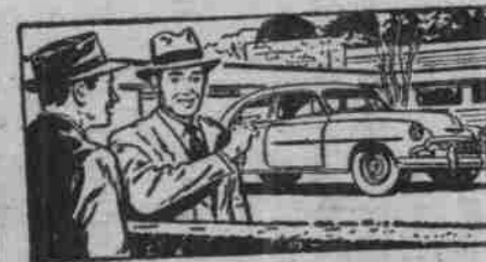
EXTRA PRESTIGE of America's Most Popular Car