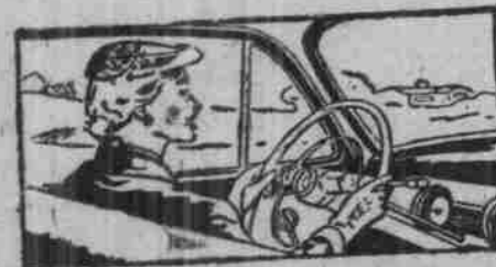
EXTRA STEERING EASE of Center-Point Steering