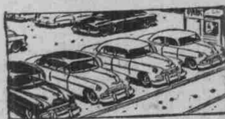
EXTRA WIDE CHOICE of Styling and Colors

All these Big-Car Extras with the Lowest-Priced Line in its Field!