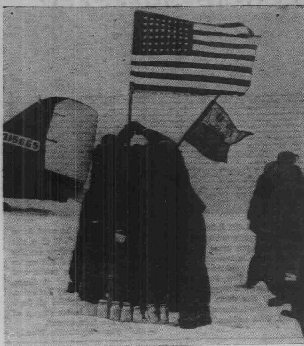
TWO MEMBERS OF THE U. S. AIR FORCE expedition that landed their ski-and-wheel equipped transport plane at the geographic North Pole are shown planting the Stars and Stripes atop an oil drum cairn. An Air Force flag flies beside it. This is the first picture of the expedition that made history's initial successful landing at the Pole. Glass jars at base of drums contain dated notes which the Air Force hopes will contribute to knowledge of Arctic Ocean currents when found at a later date.