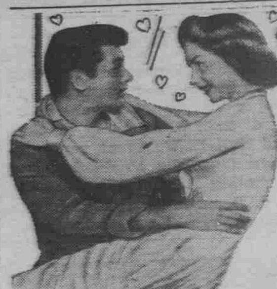
Tony CURTIS and Piper LAURIE