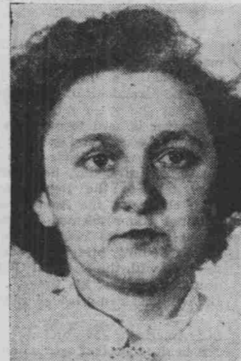
JULIUS (RIGHT) AND ETHEL (left) Rosenberg, two atomic spies who were sentenced to death in New York, have been denied their appeal for commutation of their death sentences by the Supreme Court. They are awaiting execution in Sing Sing Prison. The Rosenbergs were sentenced by the government 18 months ago for helping a Soviet espionage ring steal U. S. A-bomb secrets.

Elisha Mitchell was born in Connecticut and educated at Yale. After he came to the UNC faculty he made many trips throughout the state on horseback, going to different mountains to satiate his scientific zeal. It was on one of these trips that, with a barometer ordered from Paris, Mitchell measured the mountain which later was named for him. The height is 6,684 feet.