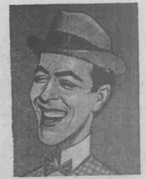
"The only way to behave to a woman is to make love to her if she is pretty, and to someone else