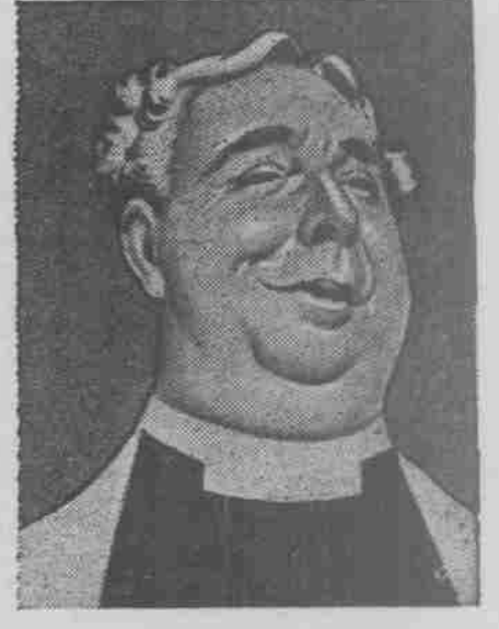
"My sermon on the meaning of man in the wilderness can be adapted to almost any occasion, joyful, or, as in the present case,