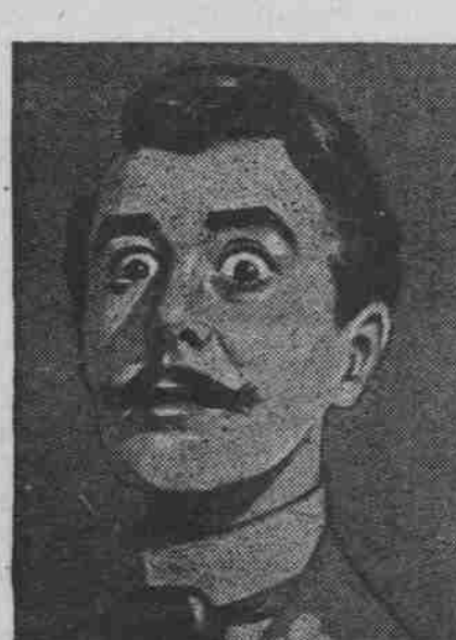
"It is a terrible thing for a man to find out suddenly that all his life he has been speaking nothing but the truth".