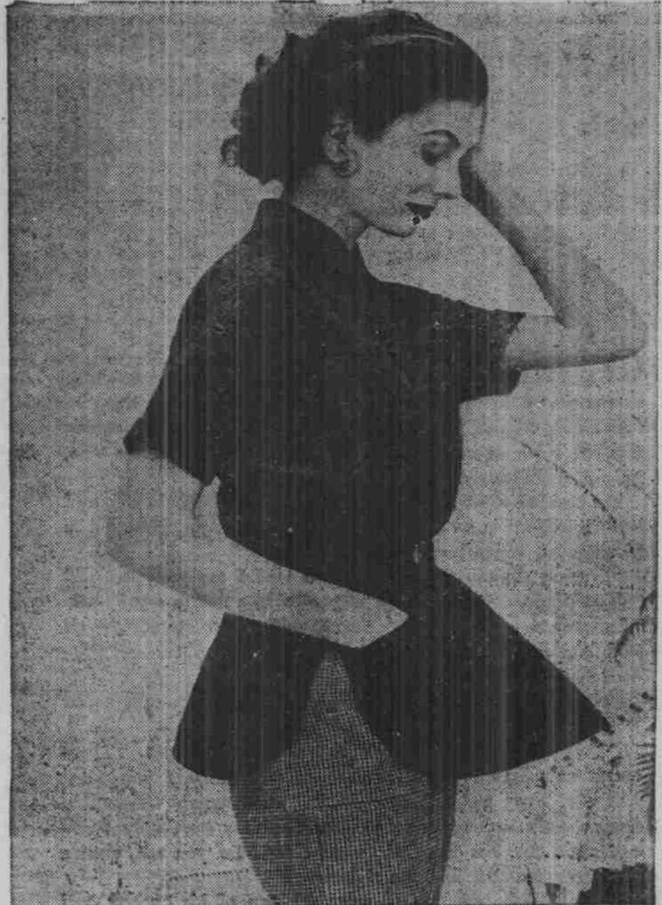
GOOD FOR THOSE PARTIES at Hogan's and beach weekends is this combination of cotton denim pedal pushers and jacket. Featured in Harper's Bazaar, the jacket comes in solid tones of turquoise, red, brown, charcoal and light blue. About $6.00. Checked pedal pushers in the same colors for about $5.00.