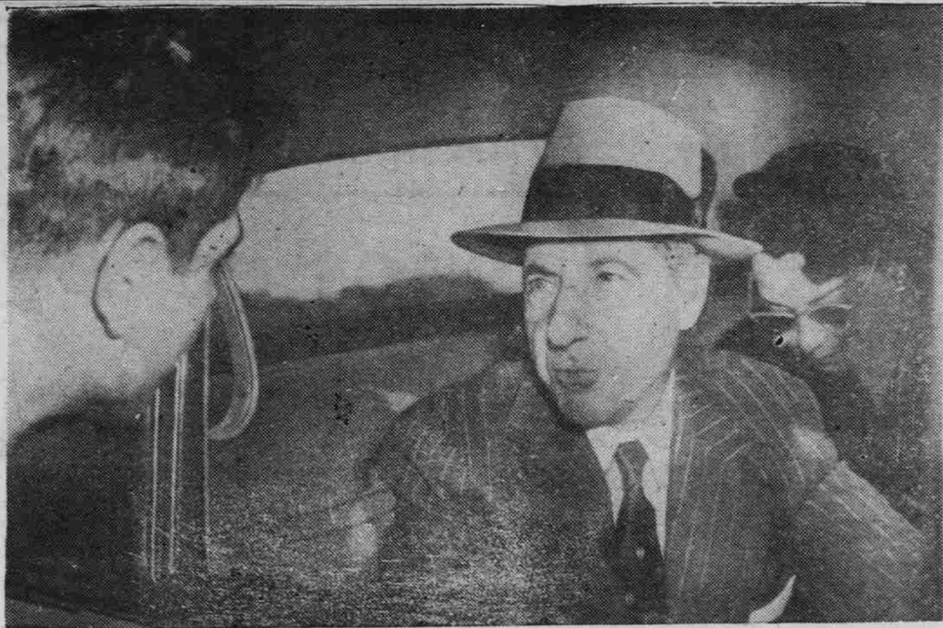
FRANK COSTELLO, RELEASED from the Federal Correctional Institution in Milan, Mich., after serving about a year of his 18 months sentence for contempt of the U. S. Senate, asks an unidentified newsman to "stop chasing me." Costello was driven from the prison in a private car which was followed by a flock of news men. Newsmen said Costello's auto approached 100 miles-an-hour during the chase. Mrs. Costello is shown in the back seat of the car.