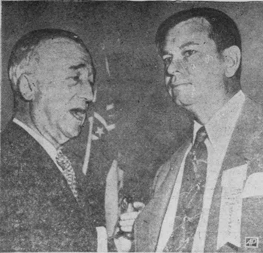
GOV. HERMAN TALMADGE (right), of Georgia, chats with Gov. James F. Byrnes of South Carolina at the Southern Governors Conference at Hot Springs, Va. Gov. Talmadge, chairman of the conference, declared at the meeting that a Supreme Court decision to end racial segregation in southern schools would be "nothing less than a major step toward national suicide."

He goes on to say that he would rather coach under the two-plate system because that way "you can think about one thing and