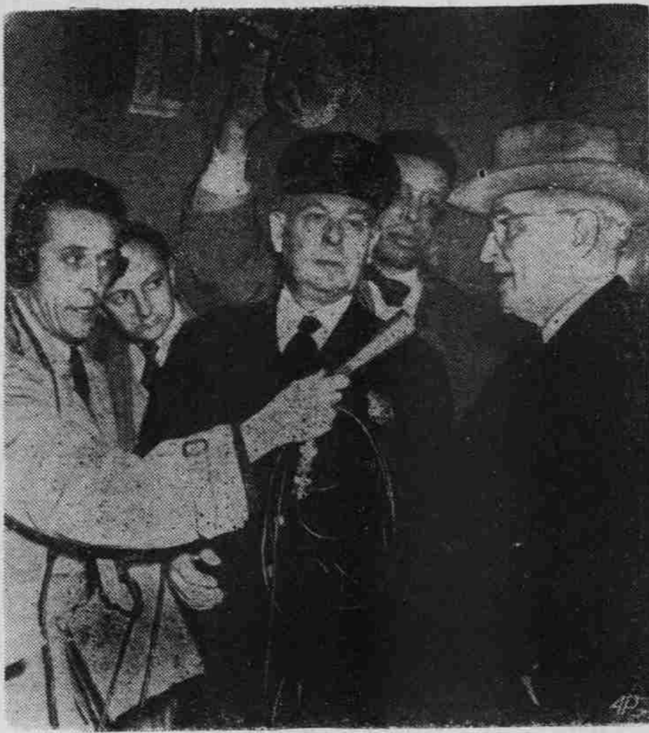
A RADIO technician pushes the microphone of his portable recording machine toward former President Harry S. Truman in New York's Pennsylvania railway station, in hopes of getting added quotes on the departing visitor's forthcoming broadcast.

The purpose of the meeting is to nominate seats for Legislature in districts 1, 2, 3, 4 and 5 and town women.