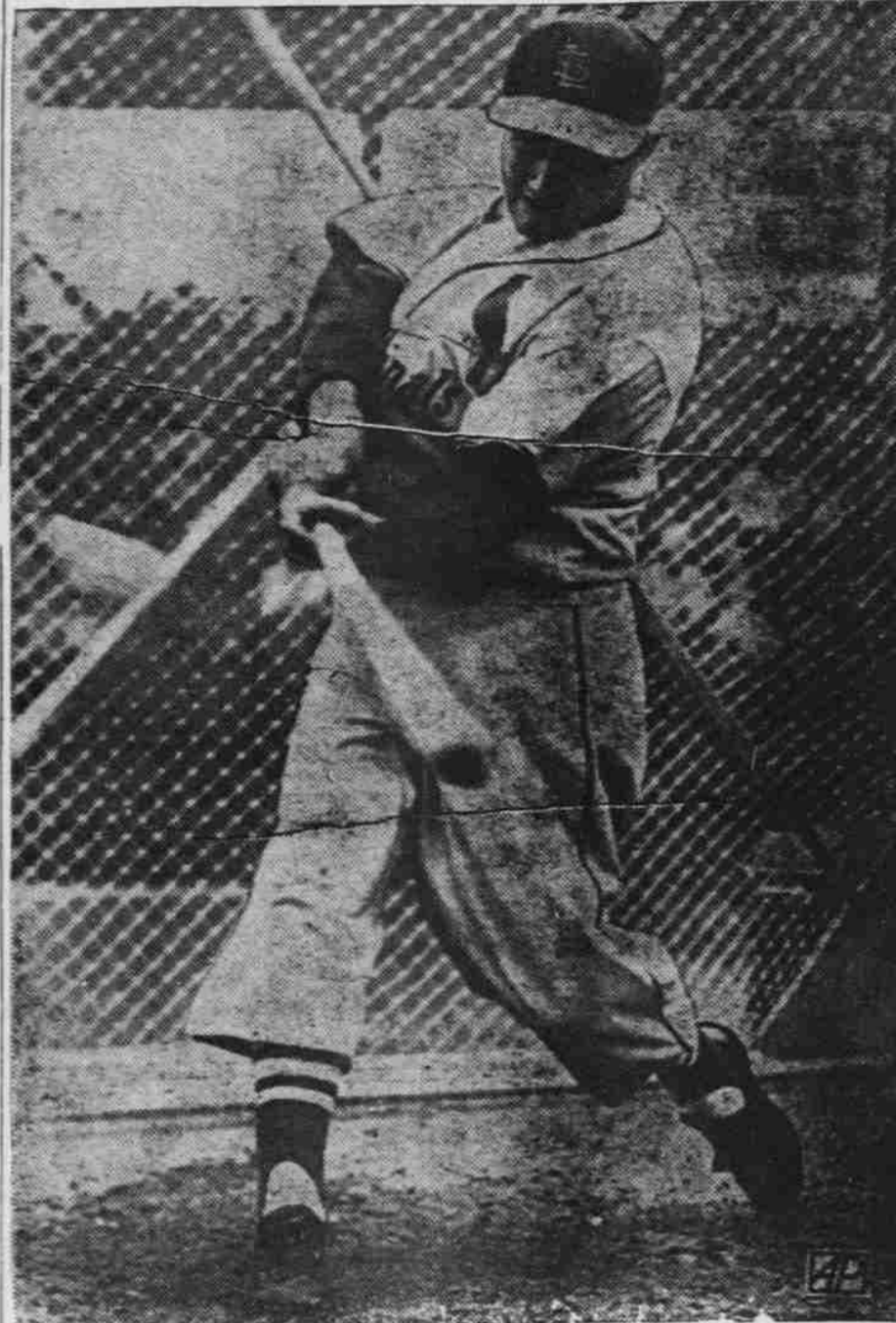
HERE'S THE SWING that's probably feared most by National League pitchers. The batter is Stan Musial of the St. Louis Cardinals and he's really putting the wood to the ball as he connects during spring training at St. Petersburg, Fla. The blur at left is ball sailing toward outfield.