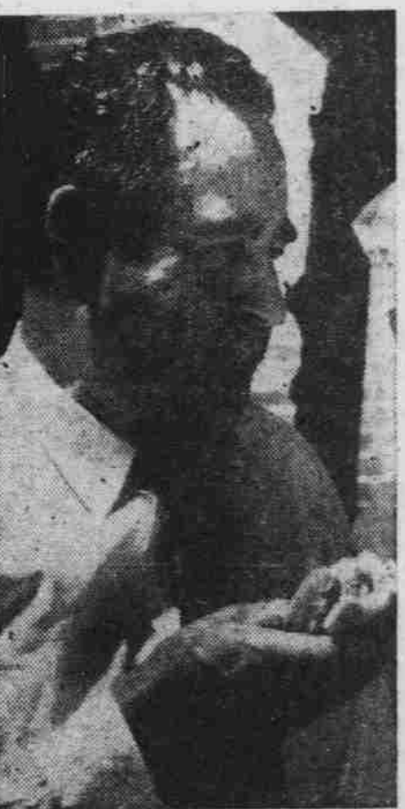
W. KERR SCOTT ... eats fish today