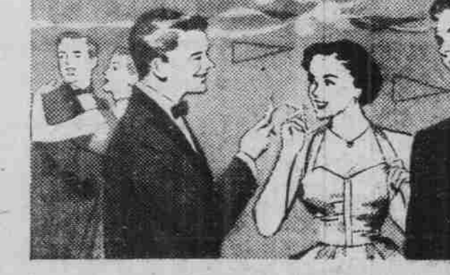
SUCCESS STORY: Camels—America's most popular cigarette... by far!

R. J. Reynolds Tobacco Company, Winston-Salem, N. C.