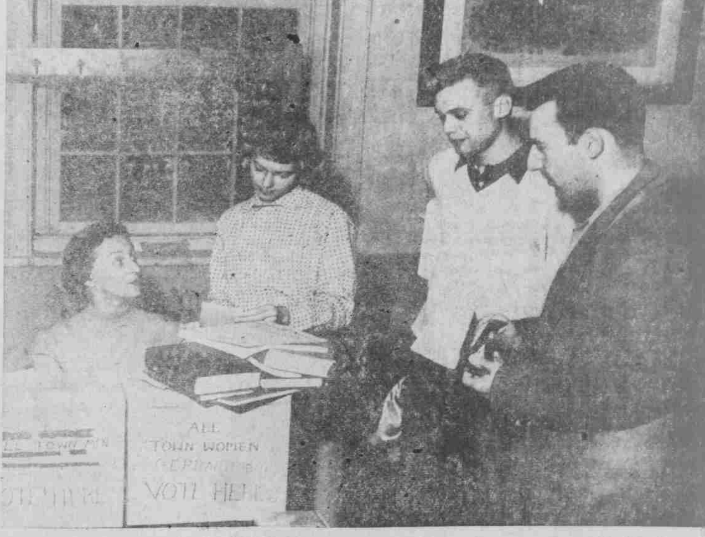
... WHILE TOWN MEN EXERCISE THEIR RIGHTS