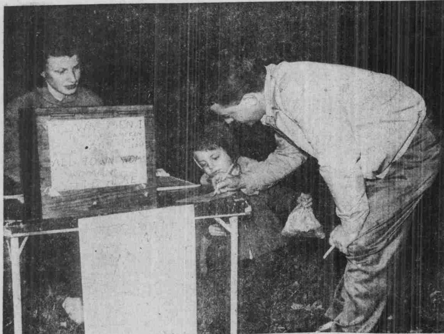
STUDENTS IN VICTORY VILLAGE VOTE ...