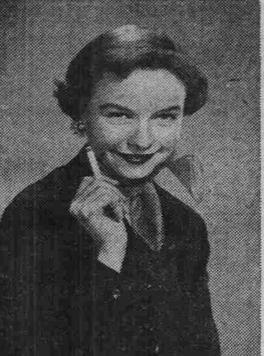
Actress Diana Lynn: This is the best filter of all-L&M's Miracle Tip.