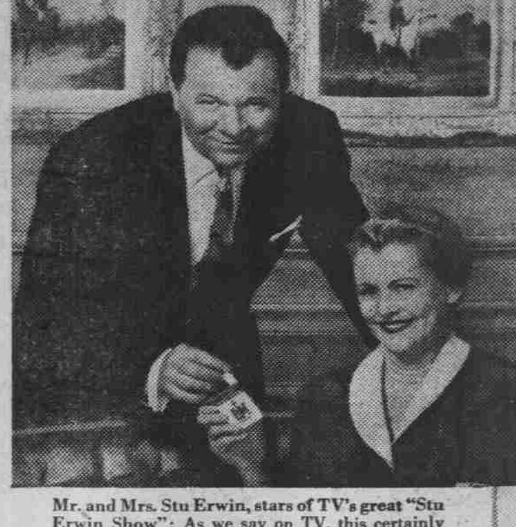
Erwin Show": As we say on TV, this certainly is the Miracle Tip. L&M's filter beats 'em all.