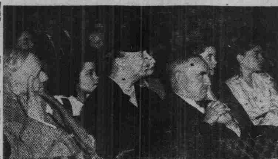
DR. FRANK & ELEANOR ROOSEVELT . . . permanent universal peace

ahead for the American people which makes men free will rise "is not back to self- defeating nat- again with the organization of the ional isolation, nor down the road people's demands. The light of to preventive war which would be liberty will yet shine through the ger than the 81/2" by 11", either the third World War but up the iron curtains of men's minds. The difficult road of the United Nat- warmth of human brotherhood patient work for freedom and away the iron curtains of men's