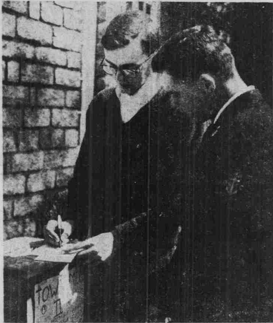
VOTING ... a lot of it yesterday