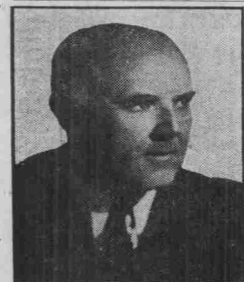
PIANIST GIESEKING Memorial Hall tomorrow