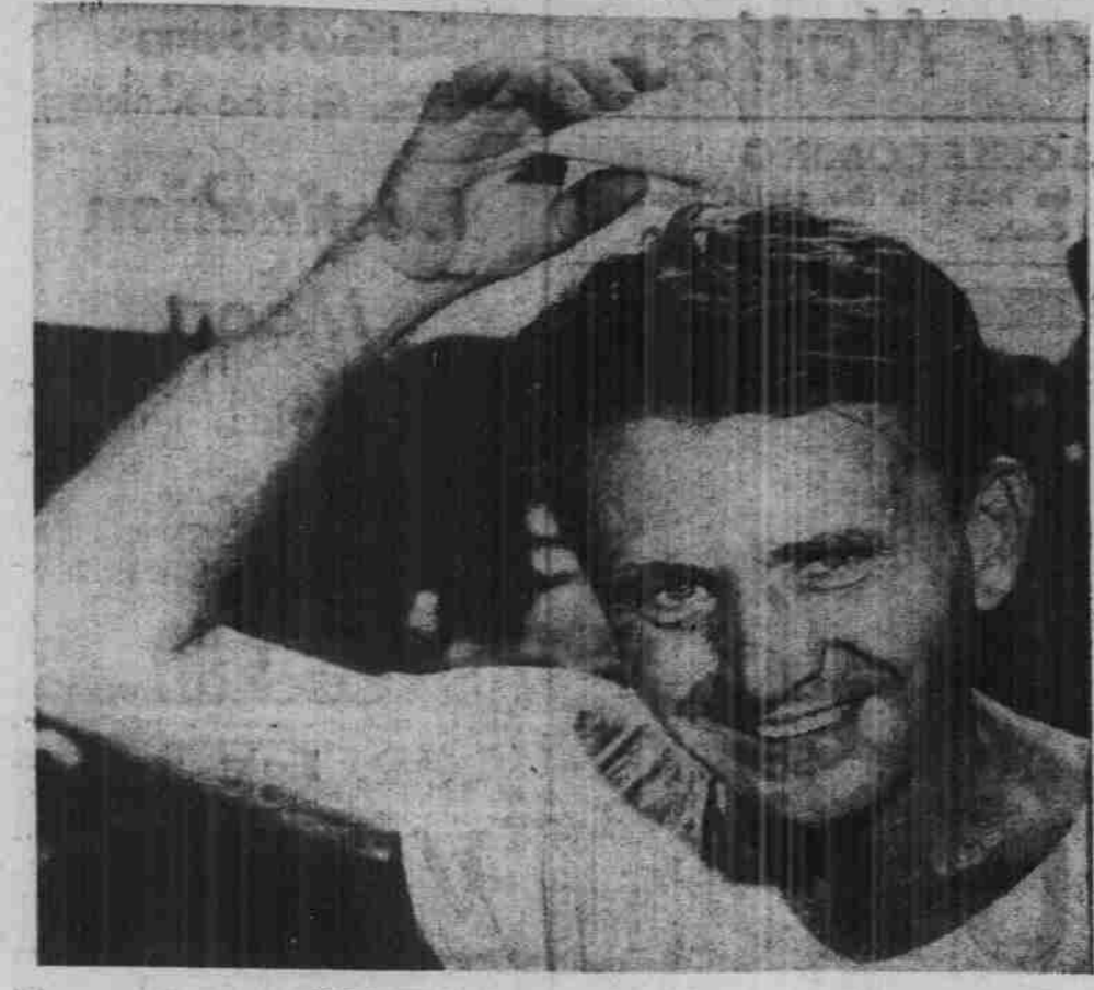
GRANT . . . UNC Great Returns