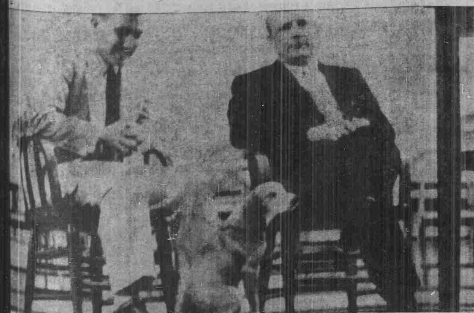
Sen. Knowland Had Visitor From The Audience