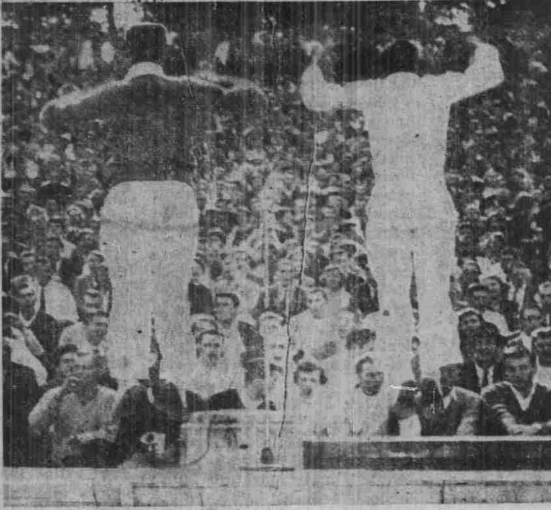
coming Weekend Cheering Started Friday Night, Went Through Saturday Morning Into Afternoon