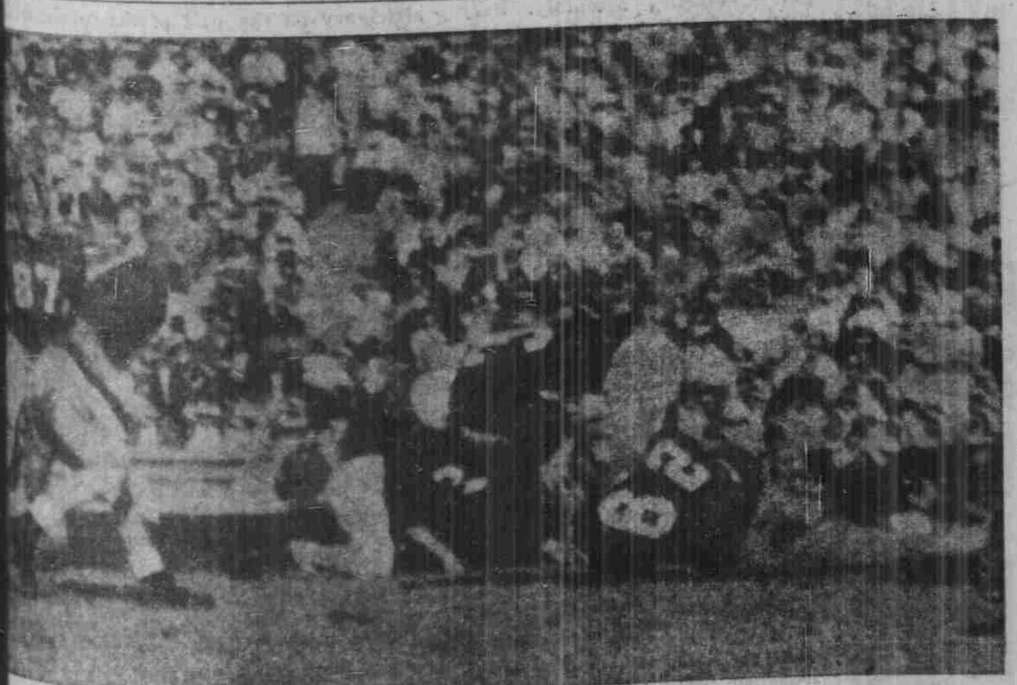
Scenes As Carolina Threw Scare Into Notre Dame Shown above is one of the spirited plays in Saturday's contest in which UNC threw a real scare into Notre Dame.