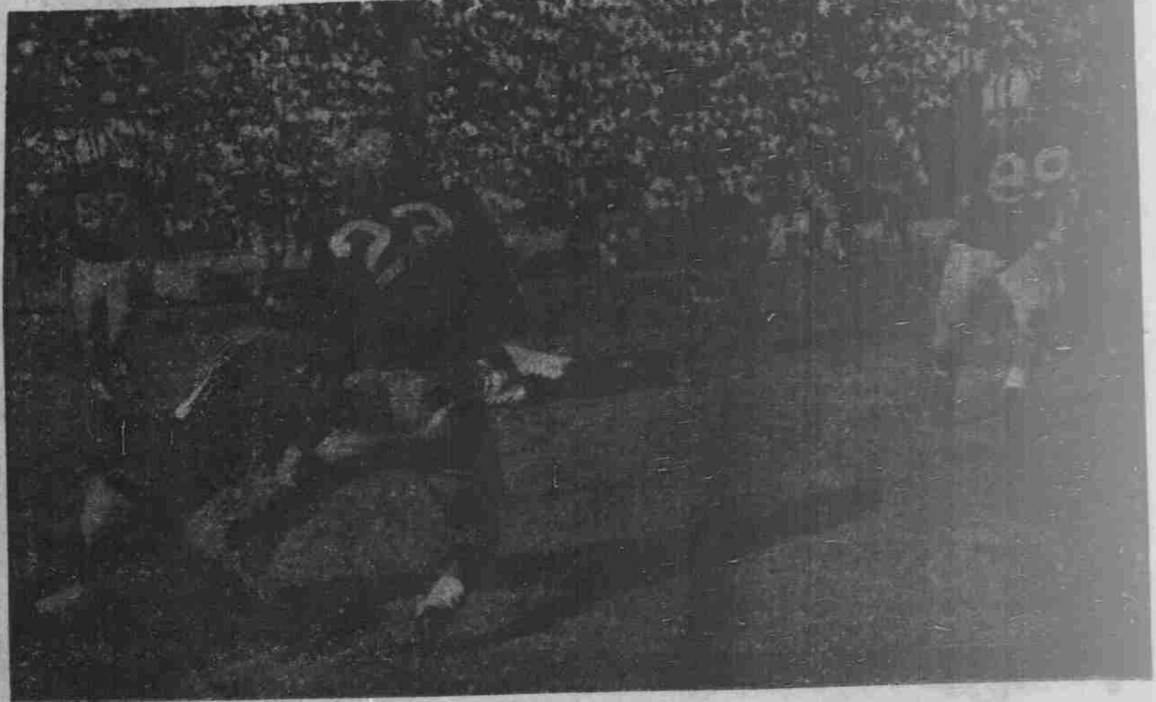
More Scenes From Notre Dame-UNC Contest Play was exciting and at times rough as UNC and Notre Dame clashed before 35,000 fans in Kenan Stadium.