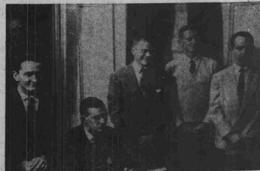
Interdormitory Council Court