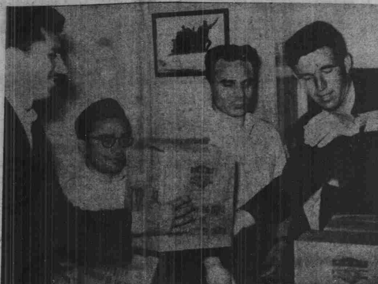
Here's Where Some Of The Campus Chest Money Collected Here Goes